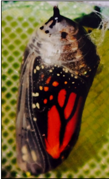
Linda DeGraf © 2015

“Is there enough Silence for the Word to be heard?”