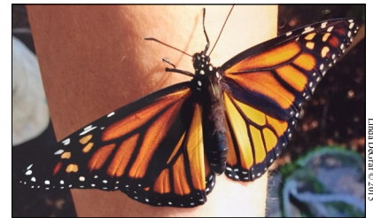
Linda DeGraf © 2015

difference can our tiny, individual metamorphoses really make? I cannot begin to fathom how the beating of one butterfly’s wings could possibly cause even a whisper of a ripple on the other side of the globe. But we are not just individuals; we are part of a whole stream of life. As we awaken to our true self, we discover communion with the luminous web and begin to take our place in the cosmic dance.