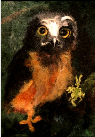
Linda DeGraf © 2012

“Is there enough Silence for the Word to be heard?”